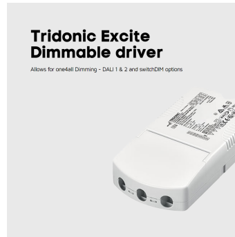
Tridonic Excite Dimmable driver

Allows for one4all Dimming - DALI 1 &amp; 2 and switchDIM options